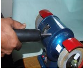
Bearing Condition & Noise Monitoring